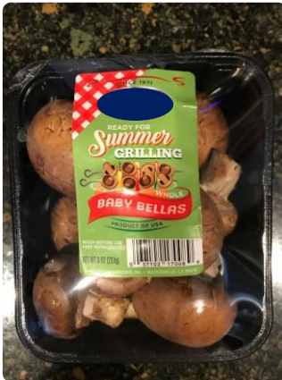
Highlight the mushroom opportunity in grilling