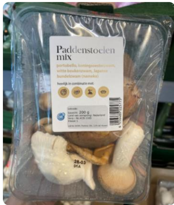
Icons to highlight popular applications