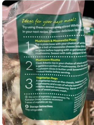
Provide recipes surrounding items mushroom household tend to buy, including a vegetarian/vegan option