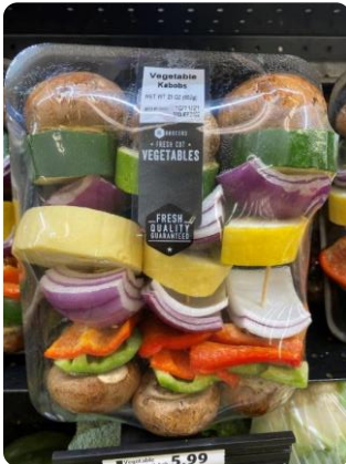
Common cross-purchase items on veggie kabobs