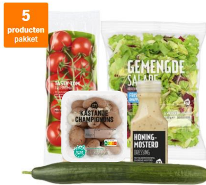
BBQ bundles with common co-purchases