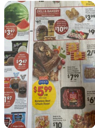
Suggestive selling in the ad