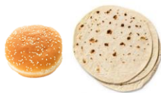
Tortillas/ flatbreads and center- store bread