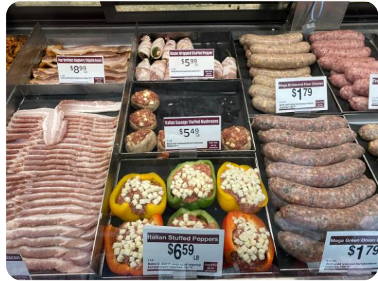
Sausage-stuffed mushrooms, with a cross-purchase index of Italian sausage and mushrooms of 122