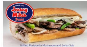
Grilled Portabella Mushroom and Swiss Sub

MANASQUAN, N.J. — What's your number? #64! After a year-long try out, Jersey Mike's Subs assigns an official number—64—to its Grilled Portabella Mushroom and Swiss Sub, awarding the popular meatless option a coveted place on the permanent menu board.