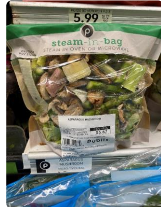
Align vegetable mixes with popular cross-purchase items, including asparagus, at 170