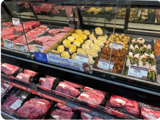
Co-merchandise marinated/seasoned mushrooms in the full-service meat counter