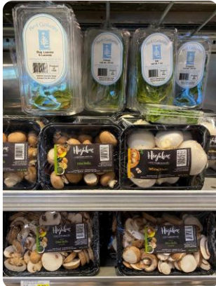
Co-merchandise fresh herbs and mushrooms with a cross-purchase index of 159 for fresh basil