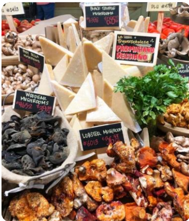
Specialty mushrooms with deli cheese