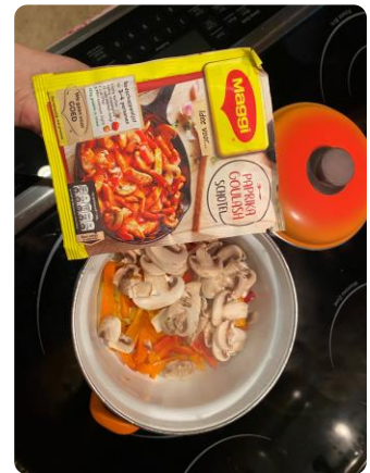
Suggested addition of fresh mushrooms