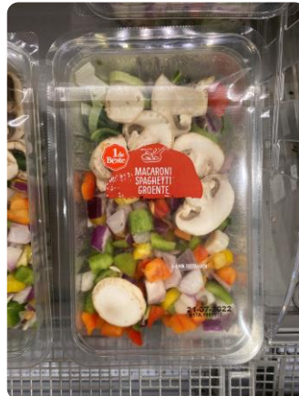
Vegetable mixes with mushrooms